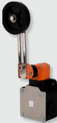
B-304-ARL (Normal) B-314-ARL (Snap)