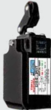
D-502 (Normal) D-512 (Snap)