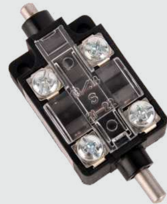
ALS-011/2WAY (Snap) 1NO + 1NC