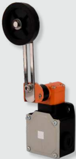
B-304-ARRL (Normal) B-314-ARRL (Snap)