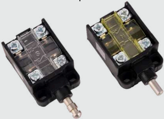
LSN/LS-001 Normal (1NO + 1NC) LS-001 OL Normal (1NO + 1NC) LS-001/3A Normal (2NO + 1NC) LS-001/3B Normal (1NO + 2NC) LS-001/2A Normal (2NO) LS-001/2B Normal (2NC) LSN-011 Snap (1NO + 1NC) LSN-011/PP Snap (1NO + 1NC)