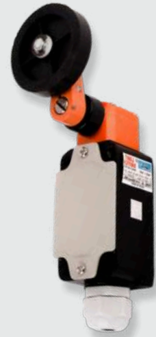
B-404/38/76-RRL (Normal) B-414/38/76-RRL (Snap)