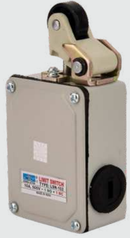
LSN/LS/ALS-102 (Normal) LS-102/2A/2B/3A/3B (Normal) LSN/ALS-112 (Snap)