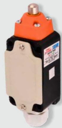
B-4-0-OT (Normal) B-4-1-OT (Snap)