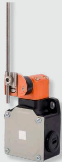
B-304-ANT (Normal) B-314-ANT (Snap)