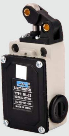
ML-02 (P) (Normal) ML-12 (P) (Snap)