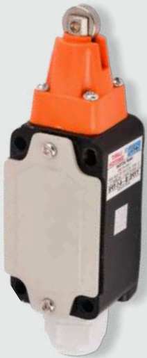
B-4-0-TPR (Normal) B-4-1-TPR (Snap)