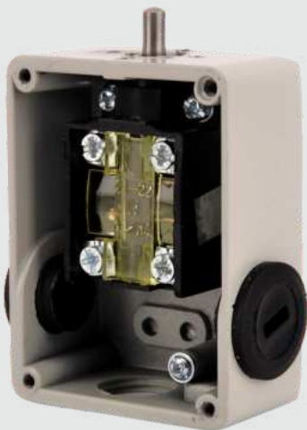
LSN-Series Standard Open View