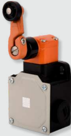
B-304/38/76 (Normal) B-314/38/76 (Snap)