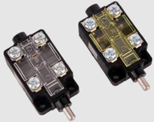
ALS-001 Normal (1NO + 1NC) ALS-011 Snap (1NO + 1NC)