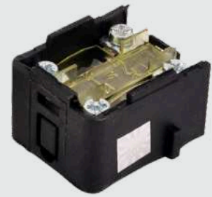
M-001 Normal (1NO + 1NC) M-011 Snap (1NO + 1NC)