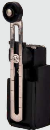
D-504-ARL (Normal) D-514-ARL (Snap)