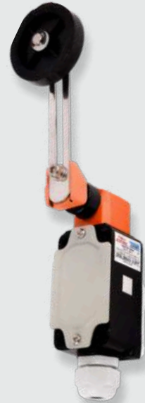
B-404-ARRL (Normal) B-414-ARRL (Snap)