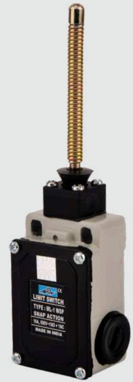
ML-O-WSP/WST/WCW (Normal) ML-1-WSP/WST/WCW (Snap)