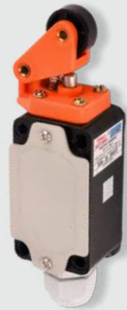
B-402 (Normal) B-412 (Snap) (Angular Bracket Roller Lever also available)