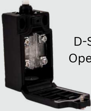
D-Series Open View