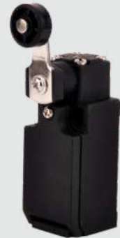
D-504 (Normal) D-514 (Snap)