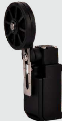
D-504-ARRL (Normal) D-514-ARRL (Snap)