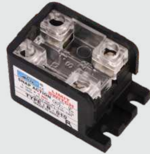
B-000/FP Normal (1NO + 1NC) B-010/FP Snap (1NO + 1NC)