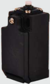
D-501 (Normal) D-511 (Snap)