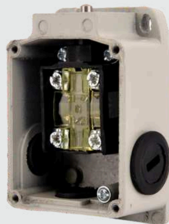
LSN-Series Oil-Tight Open View