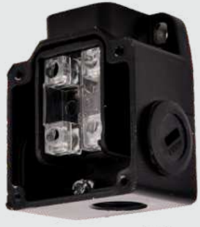
B-Series Wide Body Open View