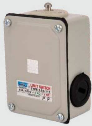
LSN/LS/ALS-101 (Normal) LS-101/2A/2B/3A/3B (Normal) LSN/ALS-111 (Snap)