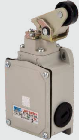
LSN/LS/ALS-203 (Normal) LS-203/2A/2B/3A/3B (Normal) LSN/ALS-213 (Snap)