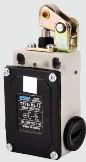
ML-02 (M) (Normal) ML-12 (M) (Snap)