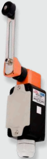
B-404-ARL (Normal) B-414-ARL (Snap)