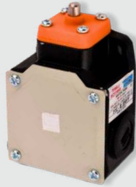
B-301 (Normal) B-301 (Snap)