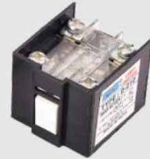
D-001 Normal (1NO + 1NC) D-011 Snap (1NO + 1NC)