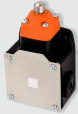
B-3-0-OT (Normal) B-3-0-OT (Snap)