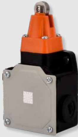
B-3-0-TPR (Normal) B-3-1-TPR (Snap)