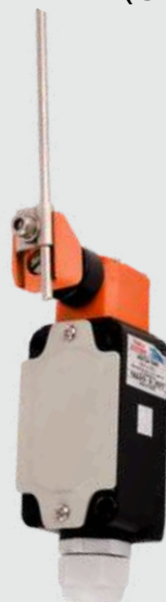
B-404-ANT (Normal) B-414-ANT (Snap)