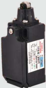
D-50-TPR (Normal) D-51-TPR (Snap)