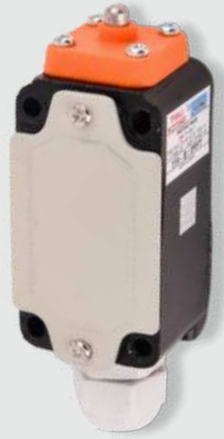
B-401 (Normal) B-401 (Snap)