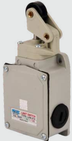
LSN/LS/ALS-202 (Normal) LS-202/2A/2B/3A/3B (Normal) LSN/ALS-212 (Snap)