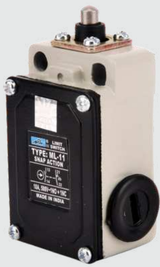
ML-01 (Normal) ML-11 (Snap)