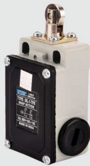
ML-O-TPR (Normal) ML-1-TPR (Snap)