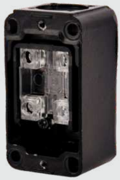
B-Series Narrow Body Open View