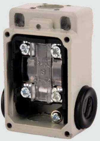
M-Series Open View