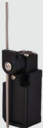
D-504-ANT (Normal) D-514-ANT (Snap)