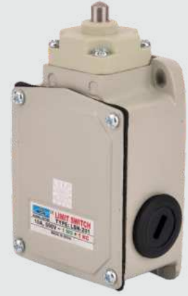
LSN/LS/ALS-201 (Normal) LS-201/2A/2B/3A/3B (Normal) LSN/ALS-211 (Snap)