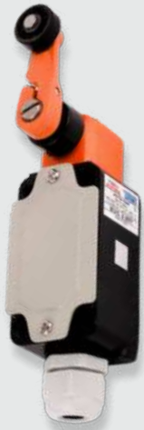
B-404/38/76 (Normal) B-414/38/76 (Snap)