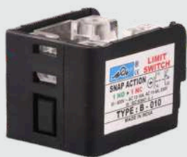
B-000 Normal (1NO + 1NC) B-010 Snap (1NO + 1NC)