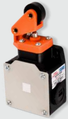
B-302 (Normal) B-312 (Snap) (Angular Bracket Roller Lever also available)